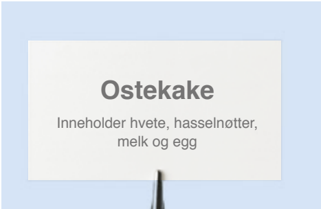
Ostekake Inneholder hvete, hasselnøtter, melk og egg