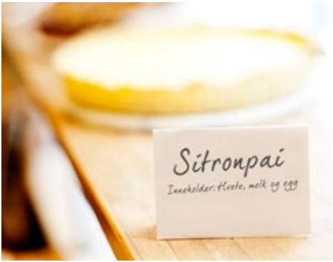
Sitronpai Inneholder: Hvete, melk og egg

If the catering firm also prepares and serves the food, it is responsible to ensure that the consumers are given written information of allergens in it.